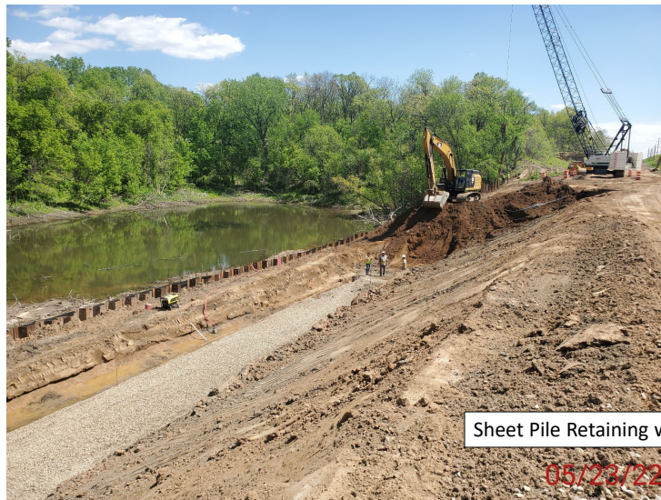
Sheet Pile Retaining wall